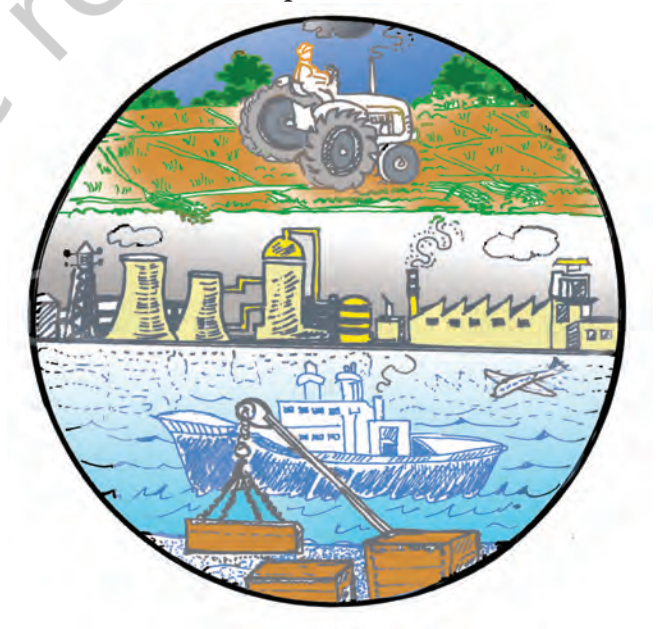
Picture 2.3 Based on the picture can you classify these activities into three sectors?

Like Vilas and Sakal, people have been engaged in various activities. We saw that Vilas sold fish and Sakal got a job in the firm. The various activities have been classified into three main sectors i.e., primary, secondary and tertiary. Primary sector includes agriculture, forestry, animal husbandry, fishing, poultry and farming, mining quarrying. Manufacturing is included in the secondary sector. Trade, transport, communication, banking, education, health, tourism, services, insurance, etc. are included in the tertiary sector. The activities in this sector result in the production of goods and services. These activities add value to the national income. These activities are called economic activities. Economic activities have two parts - market activities and non-market activities. Market activities involve remuneration to anyone who performs i.e., activity performed for pay or profit. These include production of goods or services, including government service. Non-market activities are the production for self-consumption. These can be