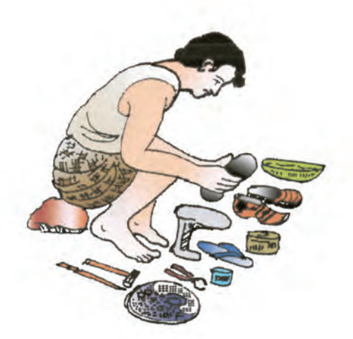
Picture 2.6 Can you remember how much did you pay when you asked him to mend your shoes or slippers?

seems forced upon them. They may therefore want other work of their choice. Poor people cannot afford to sit idle. They tend to engage in any activity irrespective of its earning potential. Their earning keeps them on a bare subsistence level.